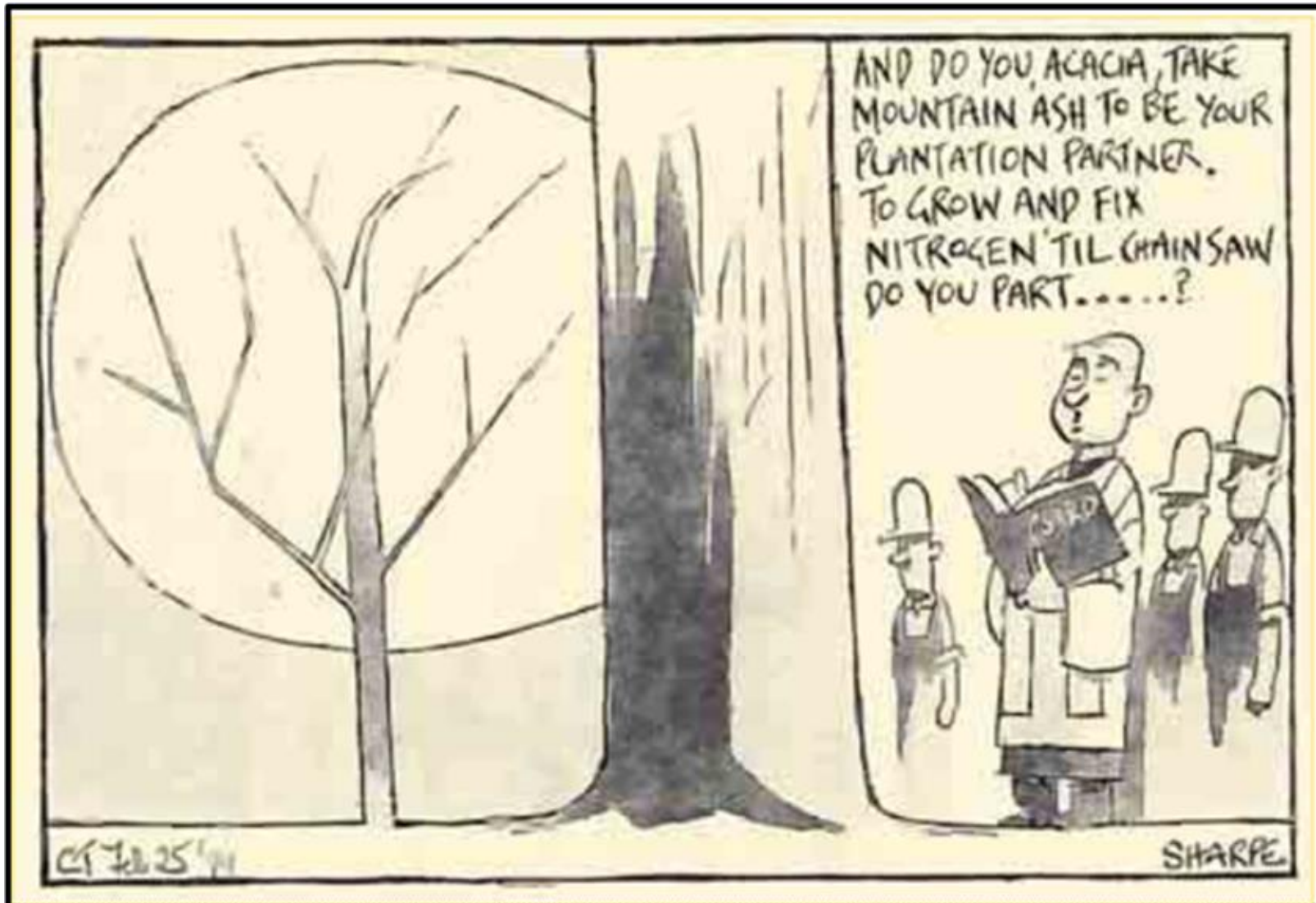
Figure 4. Cartoon about the benefits of interplanting Eucalyptus and Acacia species